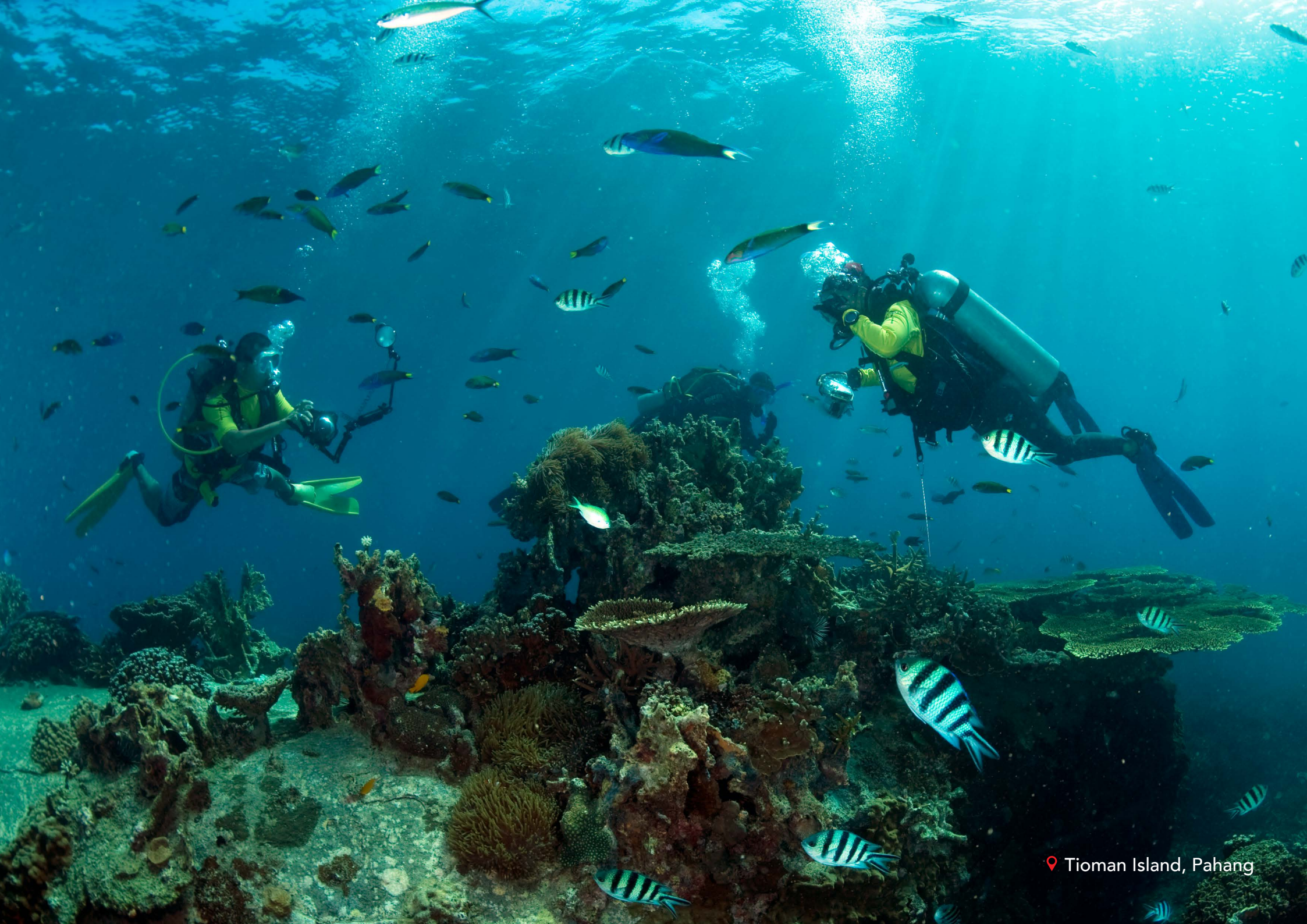
📍 Tioman Island, Pahang