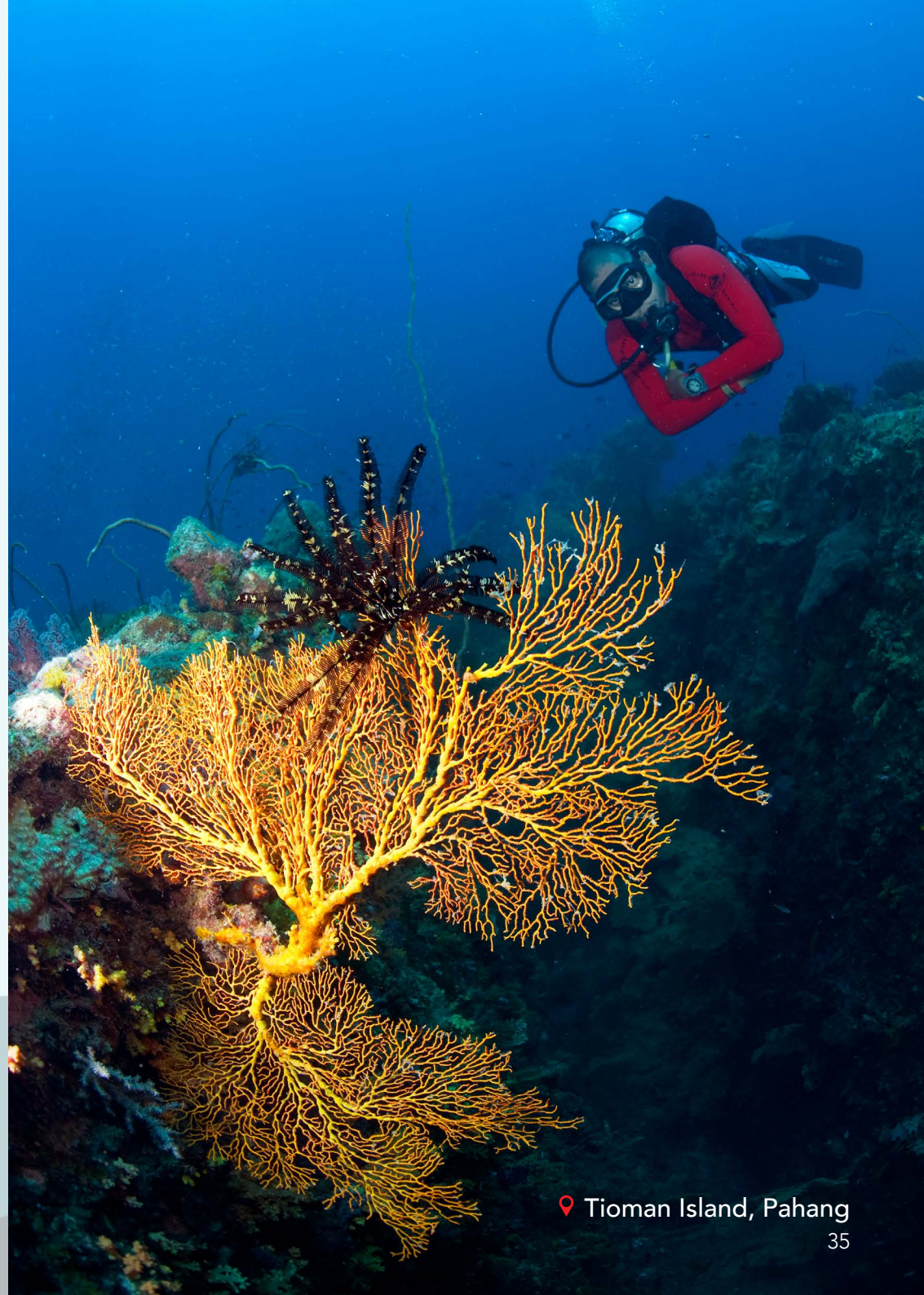
📍 Tioman Island, Pahang