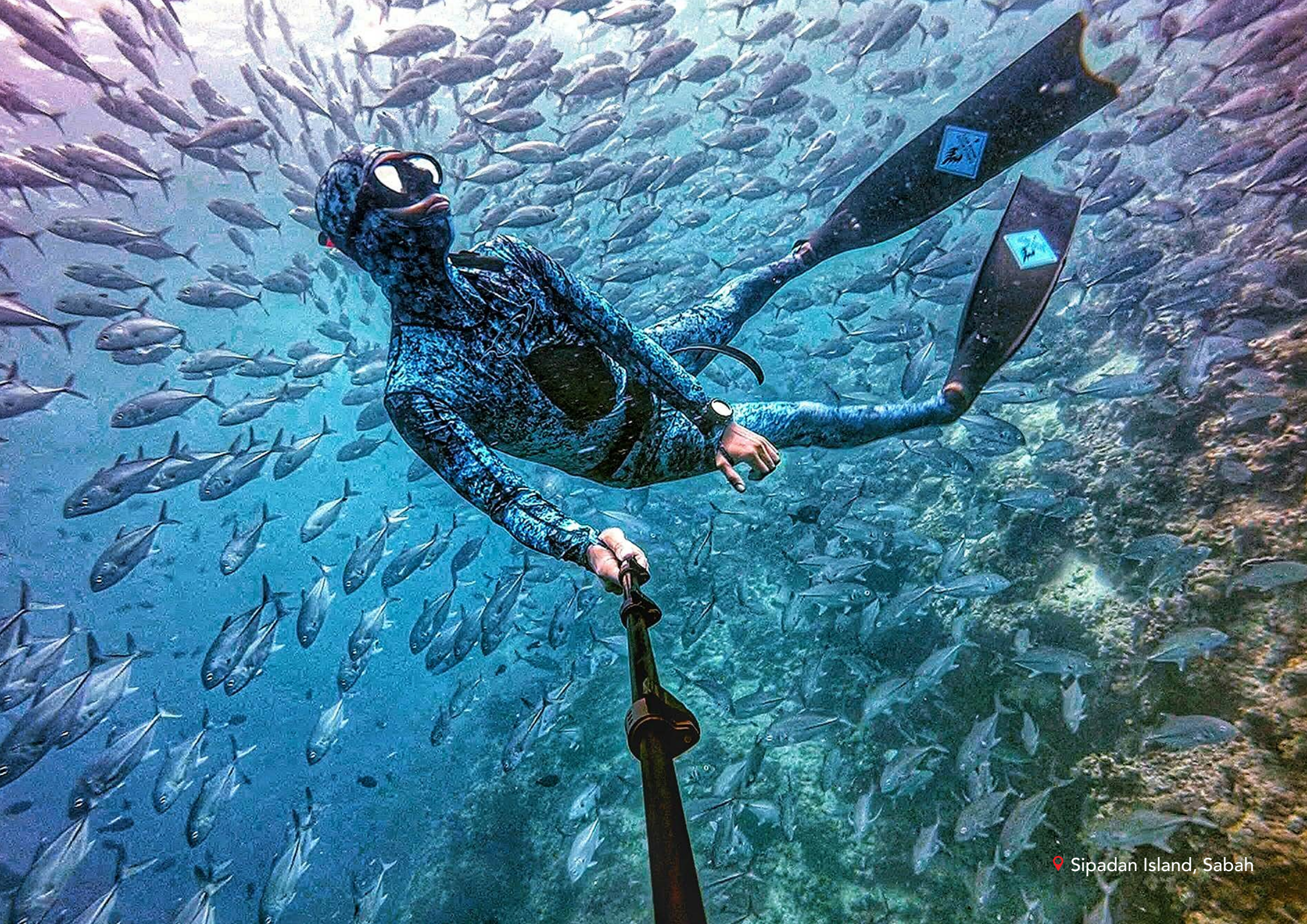
📍 Sipadan Island, Sabah