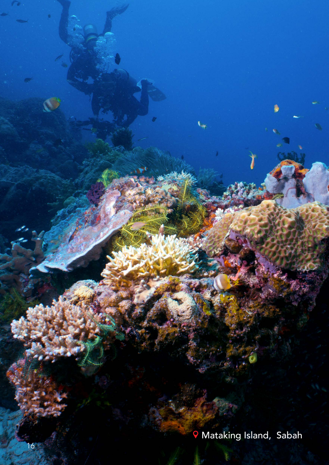
📍 Mataking Island, Sabah