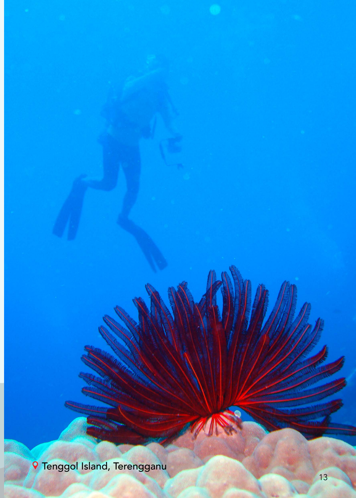
📍 Tenggol Island, Terengganu